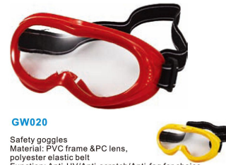
GW020 Safety goggles Material: PVC frame &PC lens, polyester elastic belt Function:Anti-UV/Anti-scratch/Anti-fog for choice More: lens color plating for choice