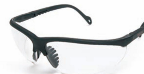
G043 Safety glasses Material: PC lens & nylon frame & adjustable legs. Black soft nose bridge pad Function: Anti-UV/Anti-scratch/Anti-fog for choice Color: Various colors for choice