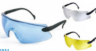
G031 Safety glasses Material: PC lens, nylon adjustable legs, Function: Anti-UV/Anti-scratch/Anti-fog for choice Color: Various colors for choice