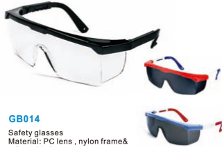
GB014 Safety glasses Material: PC lens , nylon frame& adjustable legs Function: Anti-UV/Anti-scratch/Anti-fog for choice Color: Various colors for choice Quality standard: CE EN166 &ANSI Z87.1