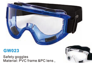
GW023 Safety goggles Material: PVC frame &PC lens , polyester elastic belt Function:Anti-UV/Anti-scratch/Anti-fog for choice More: color plating for choice CE EN166