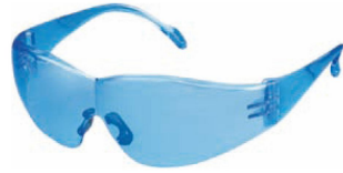
G047 Safety glasses Material: PC lens & legs Function: Anti-UV/Anti-scratch/Anti-fog for choice Color: various color for choice