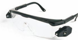
G013 Safety glasses Material: PC lens, nylon frame, nylon adjustable legs/ soft PVC legs for choice Function: Anti-UV/Anti-scratch/Anti-fog for choice. Quality standard : CE EN166 &ANSI Z87.1