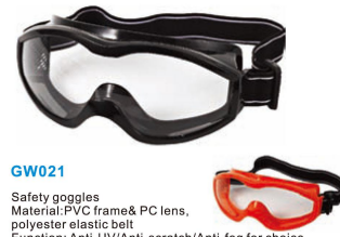
GW021 Safety goggles Material: PVC frame & PC lens, polyester elastic belt Function: Anti-UV/Anti-scratch/Anti-fog for choice More: lens color plating for choice