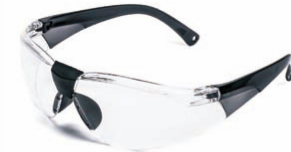
G041 Safety glasses Material: PC lens & legs. Black nose bridge pad Function: Anti-UV/Anti-scratch/Anti-fog for choice Color: Various colors for choice