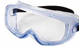
GW018 Safety goggles Material: PVC frame and PC lens Function:anti-fog and anti-scratch