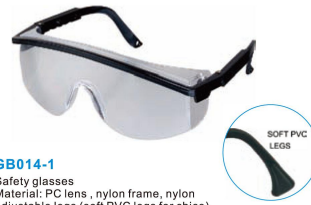
GB014-1 Safety glasses Material: PC lens , nylon frame, nylon adjustable legs (soft PVC legs for choice) Function: Anti-UV/Anti-scratch/Anti-fog for choice Color: Various colors for choice Quality standard: CE EN166&ANSI Z87.1