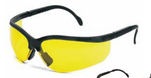
G044 Safety glasses Material: PC lens & nylon adjustable legs Black nose bridge pad Function: Anti-UV/Anti-scratch/Anti-fog for choice Color: Various colors for choice