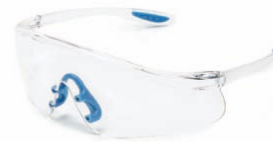
G040 Safety glasses Material: PC lens & PC legs Blue soft rubber on legs & soft nose bridge pad Function: Anti-UV/Anti-scratch/Anti-fog for choice Color: Various colors for choice