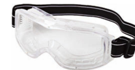
GW022 Safety goggles Material: PVC frame &PC lens , polyester elastic belt Function:Anti-UV/Anti-scratch/Anti-fog for choice More: color plating for choice