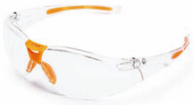
G034 Safety glasses Material: PC lens & legs Orange soft rubber on legs with orange nose bridge pad Function: Anti-UV/Anti-scratch/Anti-fog for choice Color: Various colors for choice