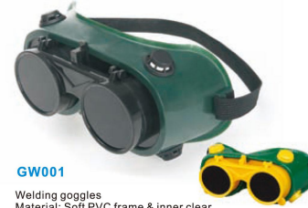
GW001 Welding goggles Material: Soft PVC frame & inner clear PVC lens & outside black glass lens, polyester elastic belt Flip design with open-close locking positioning Protection grade: 5th grade