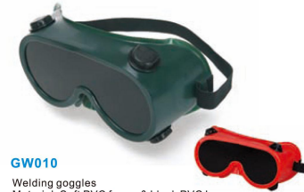
GW010 Welding goggles Material: Soft PVC frame & black PVC lens, polyester elastic belt Protection grade: 5th grade