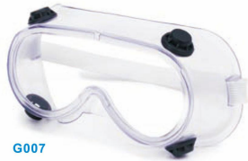
G007 Safety goggles Material: PVC frame &PC or PVC lens , polyester elastic belt Four vent valves indirect ventilation design Function:Anti-UV/Anti-scratch/Anti-fog for choice