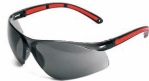
G036 Safety glasses Material: PC lens & PC/PU legs Orange soft rubber on legs Function: Anti-UV/Anti-scratch/Anti-fog for choice Color: Various colors for choice