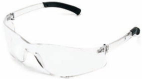
G033-4 Safety glasses Material: PC lens & legs Function: Anti-UV/Anti-scratch/Anti-fog for choice Color: Various colors for choice Quality standard: CE EN166