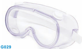
G029 Safety goggles Material: PVC frame &PC or PVC lens , polyester elastic belt Four vent valves indirect ventilation design Function:Anti-UV/Anti-scratch/Anti-fog for choice