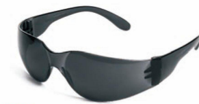
G033-2 Safety glasses Material: PC lens &legs Function: Anti-UV/Anti-scratch/Anti-fog for choice Color: Various colors for choice Quality standard: CE EN166&ANSI Z87.1