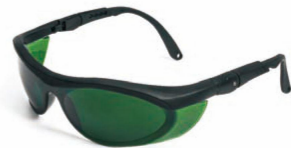
G030-1 Safety glasses Material: PC lens & nylon adjustable legs Function: Anti-UV/Anti-scratch/Anti-fog for choice Color: Various colors for choice