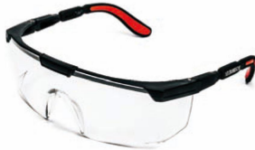
G035 Safety glasses Material: PC lens & Nylon frame & Nylon/PVC adjustable legs Orange soft rubber on legs Function: Anti-UV/Anti-scratch/Anti-fog for choice Color: Various colors for choice