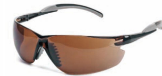
G049 Safety glasses Material: PC lens & PC/PU legs. Smoke soft nose bridge pad Function: Anti-UV/Anti-scratch/Anti-fog for choice Color: Various colors for choice