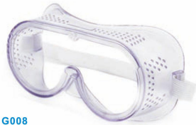
G008 Safety goggles Material: PVC frame &PC or PVC lens , polyester elastic belt Direct air holes above and both sides design Function:Anti-UV/Anti-scratch/Anti-fog for choice CE EN166 / ANSI Z87.1