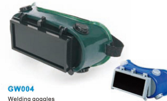
GW004 Welding goggles Material: Soft PVC frame & inner clear PVC lens & outside black glass lens, polyester elastic belt Flip design with open-close locking positioning Protection grade: 5th grade