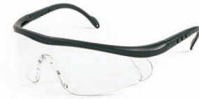
G048 Safety glasses Material: PC lens , nylon frame & adjustable legs. Function: Anti-UV/Anti-scratch/Anti-fog for choice Color: Various colors for choice