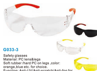
G033-3 Safety glasses Material: PC lens&legs Soft rubber /hard PC on legs ,color: orange, blue etc. for choice. Function: Anti-UV/Anti-scratch/Anti-fog for choice Color: various colors for choice