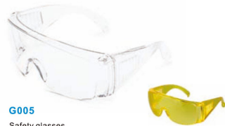
G005 Safety glasses Material: PC lens &legs Function: Anti-UV/Anti-scratch/Anti-fog for choice Color: Various colors for choice Quality standard: CE EN166