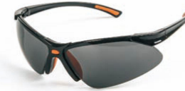
G032 Safety glasses Material: PC lens ,PC frame &adjustable legs.Orange soft rubber on legs ,orange nose bridge pad . Function: Anti-UV/Anti-scratch/Anti-fog for choice Color: Various colors for choice