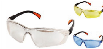
G032-1 Safety glasses Material: PC lens & Nylon/PC adjustable legs Orange Soft rubber on legs Function: Anti-UV/Anti-scratch/Anti-fog for choice Color: Various colors for choice