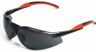
G046 Safety glasses Material: PC lens & PC/PU legs Smoke soft nose bridge pad Function: Anti-UV/Anti-scratch/Anti-fog for choice Color: Various colors for choice