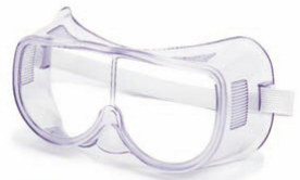
G009 Safety goggles Material: PVC frame &PC or PVC lens , polyester elastic belt Direct air holes above and both sides design Function:Anti-UV/Anti-scratch/Anti-fog for choice