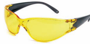
G042 Safety glasses Material: PC lens & legs. Function: Anti-UV/Anti-scratch/Anti-fog for choice Color: Various colors for choice