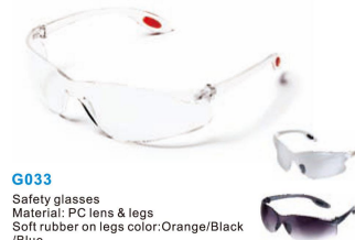
G033 Safety glasses Material: PC lens & legs Soft rubber on legs color:Orange/Black /Blue Function: Anti-UV/Anti-scratch/Anti-fog for choice Color: Various colors for choice