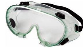
GW019 Safety goggles Material: PVC frame and PC lens Function: anti-fog and anti-scratch CE EN166