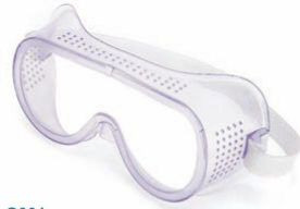
G001 Safety goggles Material: PVC frame &PC or PVC lens , polyester elastic belt Direct air holes above and both sides design Function:Anti-UV/Anti-scratch/Anti-fog for choice