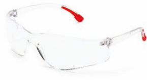
G033-5 Safety glasses Material: PC lens & legs Soft rubber on legs color: Orange/Black/Blue Function: Anti-UV/Anti-scratch/Anti-fog for choice Color: Various colors for choice