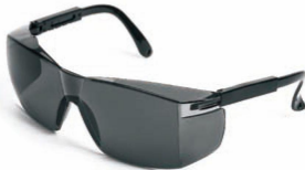
G038 Safety glasses Material: PC lens , nylon adjustable legs. Function: Anti-UV/Anti-scratch/Anti-fog for choice Color: Various colors for choice