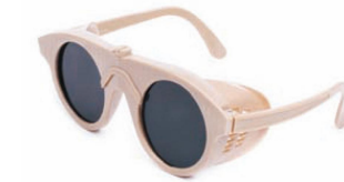
GW002 Welding goggles Material: PP frame, black color glasses lens Protection grade: 5th