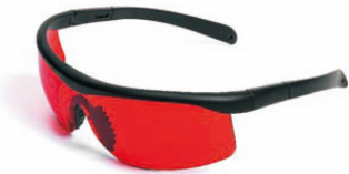
G050 Safety glasses Material: PC lens & nylon frame & adjustable legs. Black soft nose bridge pad Function: Anti-UV/Anti-scratch/Anti-fog for choice Color: Various colors for choice